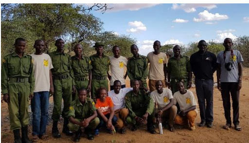
Photo: Rangers and field staff that received poison training.

Capacity Building: Adelaide Moturi attended capacity building workshops in Uganda and Kenya. The International Zoo Educators Regional Workshop in Entebbe and the Northern Kenya Conservation Education Working Group at Lewa Conservancy both focused on program development and effective communication to an audience, helping Adelaide better prepare future Conservation Education topics for schools and communities.