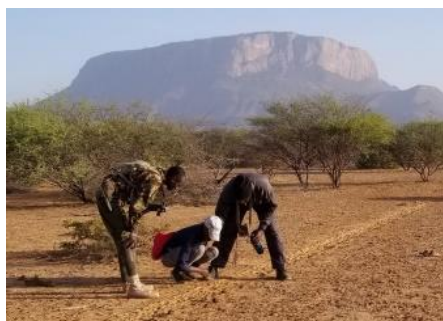
Map: Cheetah distribution showing importance of the Samburu Region. Photo: Noreen Mutoro and Javan Amihanda training Kalama Ranger on track identification. Apart from sample collection, we trained some of the rangers on carnivore spoor (tracks and scat) identification and on fecal sample collection.