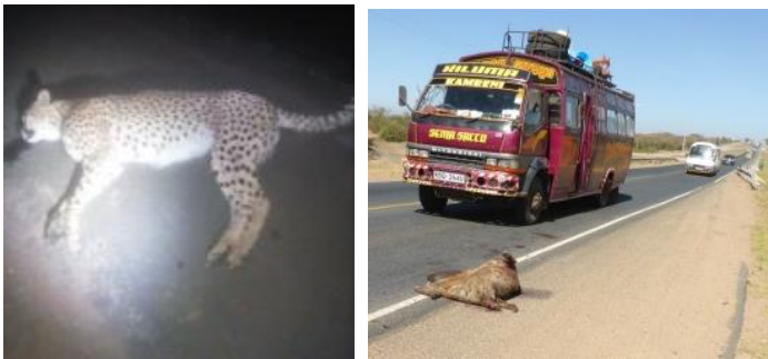
Photos: Cheetah hit by car (left) on and hyena mortality on Mombasa Highway.