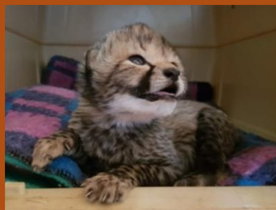
Timu upon his rescue in February.