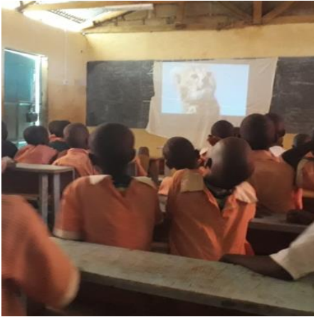
Kule Primary students in Meibae Community Conservancy watching a nature documentary.

connects students with nature, using film as a tool to channel conservation messages through predator awareness in an interesting and effective manner. The big cat documentary initiated discussions to help the audience understand the message.